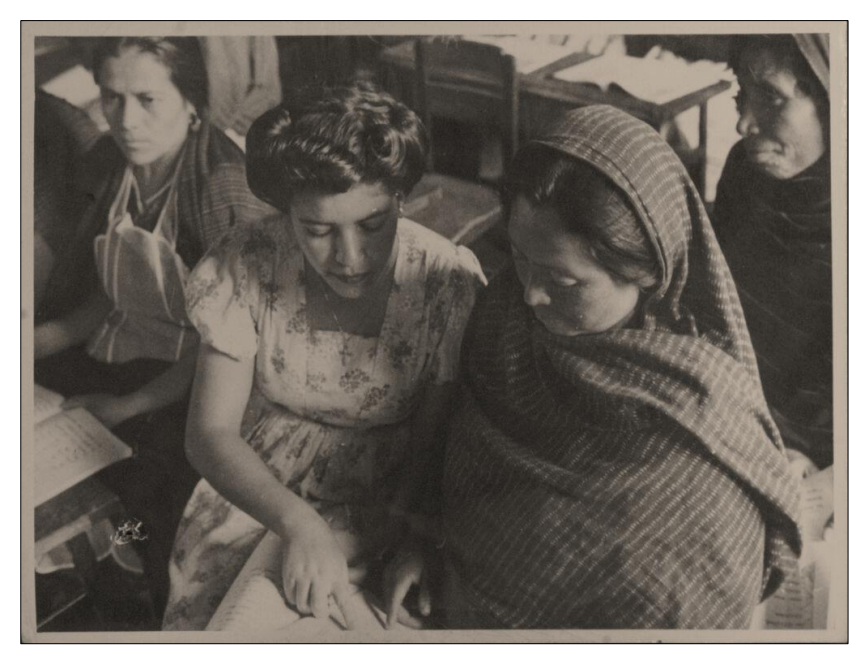
Literacy Campaign. 1945. Presidents Fund. General. Manuel Ávila Camacho.