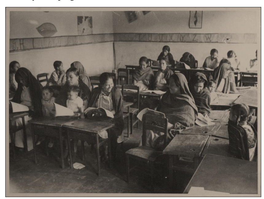
Literacy Campaign. 1945. Presidents Fund. General. Manuel Ávila Camacho.