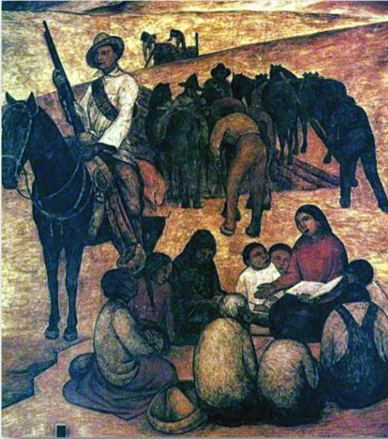
Figure 1. The rural teacher, represented in the Mural of the Department of Public Education in Mexico, was created by Diego Rivera in the post-revolutionary period. Note: Image of the original paint.

in the teaching profession. These policies were generally translated into a series of unwritten cultural practices, which were nevertheless widely recognised and assumed even by women teachers. Barred from having boyfriends, becoming pregnant or bearing children, women teachers tended to hide their civil status and their pregnancies, although a significant number of them chose celibacy or late marriage.