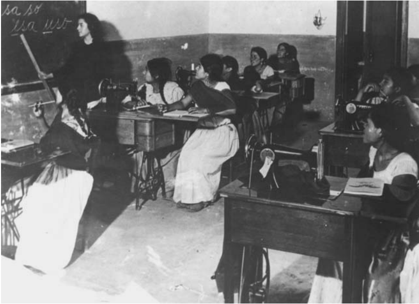
Figure 2. Revolutionary education for rural women.